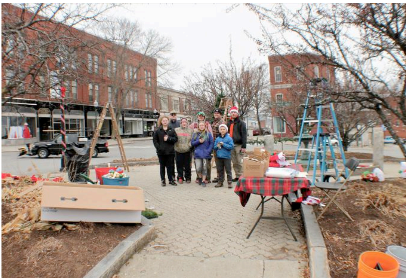
Members of the Heart of Claremont and other volunteers worked hard before the snow to begin putting up Christmas decorations in Opera House Square on Saturday, Dec. 9. Thanks to all the volunteers who work so hard to make our City a better place to live, work and play.

The Blue Christmas will take place on Sunday, Dec. 17, at 3:00 p.m. at the church on 38 Summer Street. Parking is also available next door at the real estate office lot. There will be live guitar music, and dress will be informal; come as you are. If people would like, they can bring a food item for the Claremont Soup Kitchen as a way of blessing others at this time of year.