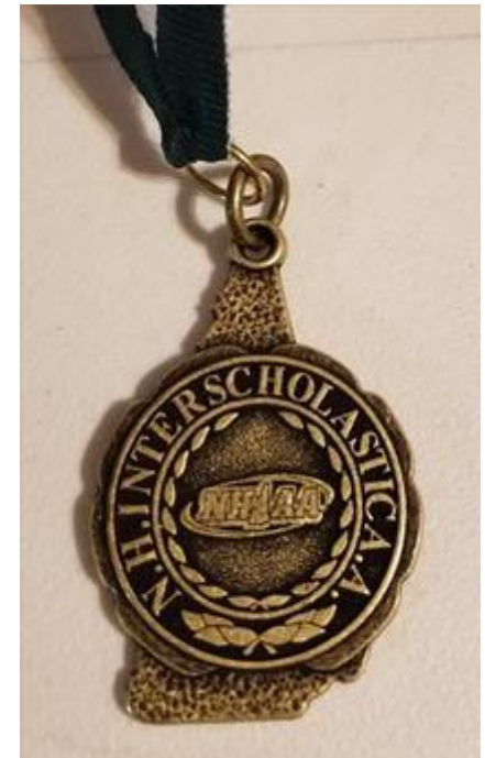
Medals awarded to the SHS Champs

the team arrived in Claremont behind a police escort, to be greeted by what seemed to be the entire city upon reaching downtown. The State title is the first State Championship in football since 1968 when Stevens shared the title with Winnacunnett. The Championship is the first for the school since the Boys Soccer team won the State Championship in 1989.