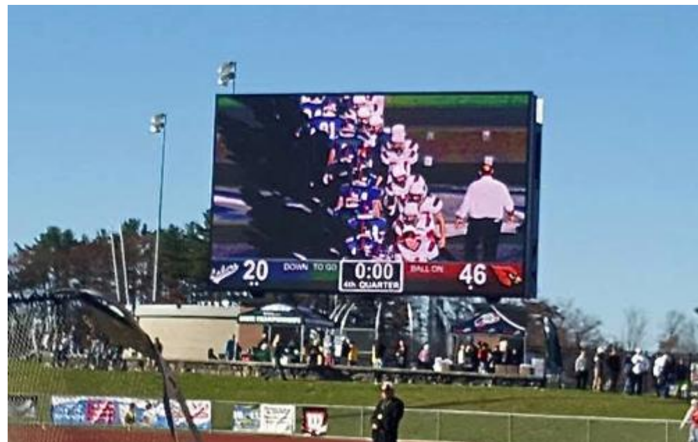
The scoreboard said it all as the clock ticked down to zero on Saturday with the Stevens Cardinals beating Interlakes-Moultonborough soundly, 46-20. Below: The display of the NHIAA awards and participating team helmets.