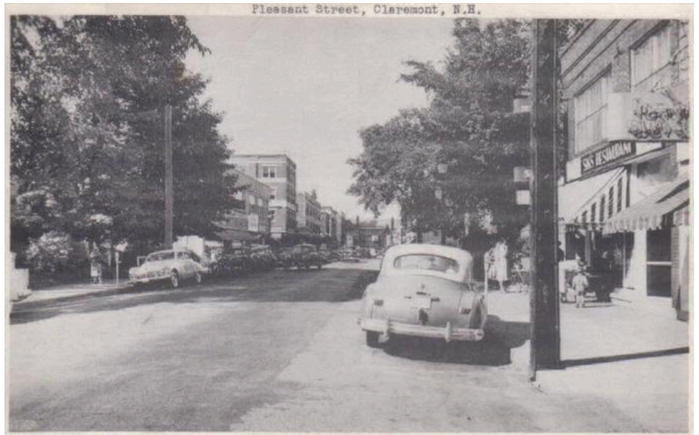
Sig's Restaurant, Pleasant St., Claremont.