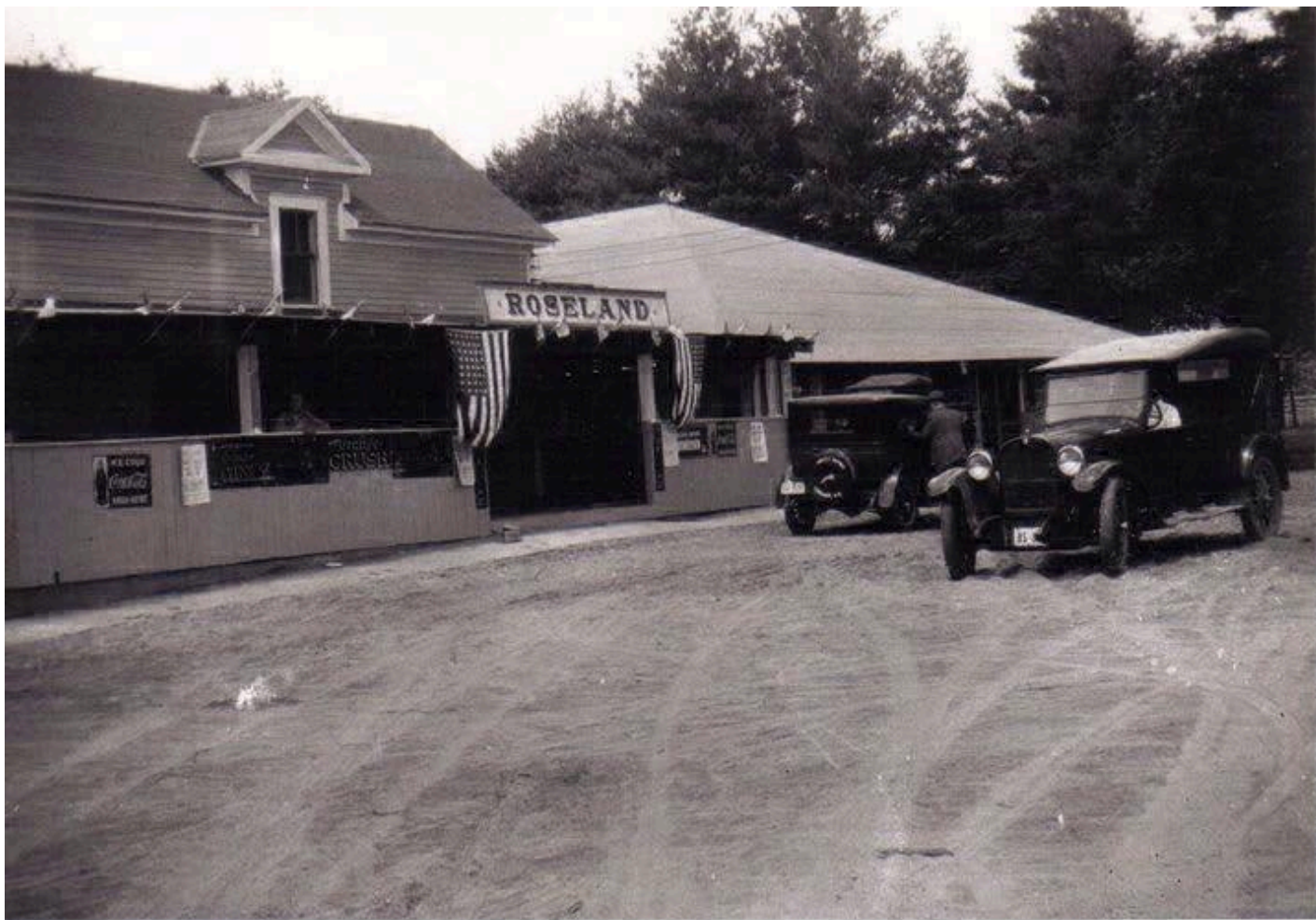
Roseland Ballroom, Bowker St., Claremont, where big bands played and the locals gathered to listen and dance; one of Claremont's most famous entertainment spots (Photo courtesy of Merle Boardman).