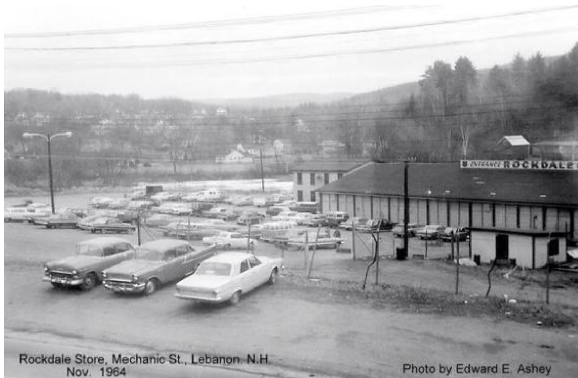
Rockdale Store, Mechanic St., Lebanon, N.H. Nov. 1964