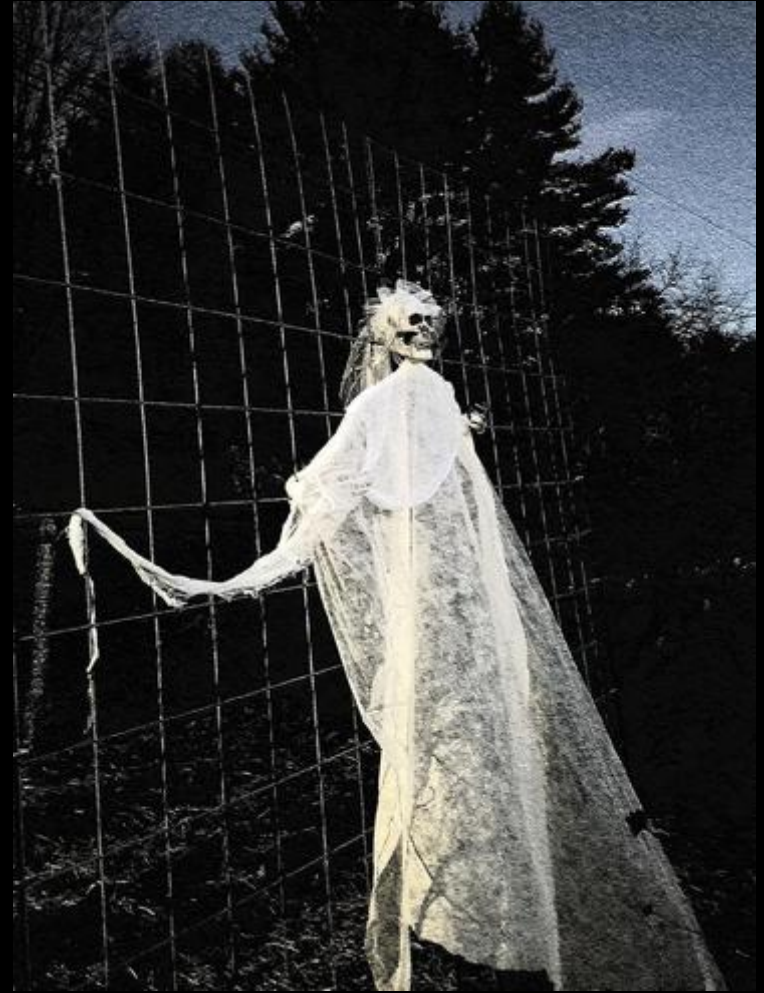
Creepy, creepier, creepiest. This skeleton in Claremont grows more ominous as Halloween nears. Hurry past to trick or treat ... if you dare.