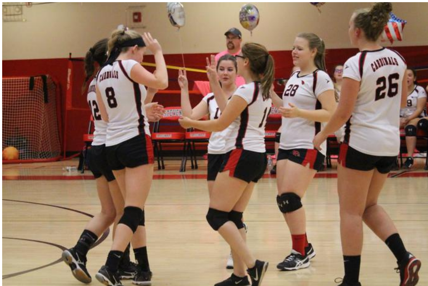
The SHS Volleyball team wrapped up its season on Thursday, hosting Franklin.