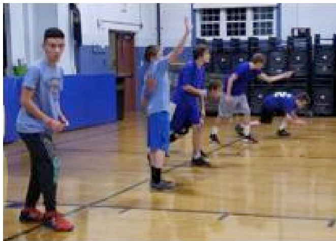
The Blue Heaters facing off against the DOT.

CHARLESTOWN, NH—On Friday evening, October 12, the first Charlestown Fall Festival started off with a bang with a rowdy Dodge Ball Tournament at the Charlestown Middle School. The following teams competed: