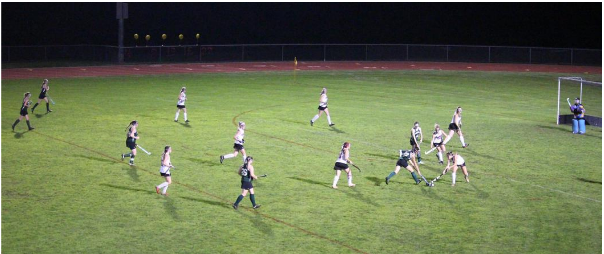
The SHS Varsity Field Hockey team defeated Monadnock Regional High School in its final regular season home game Tuesday evening by a score of 2-1.