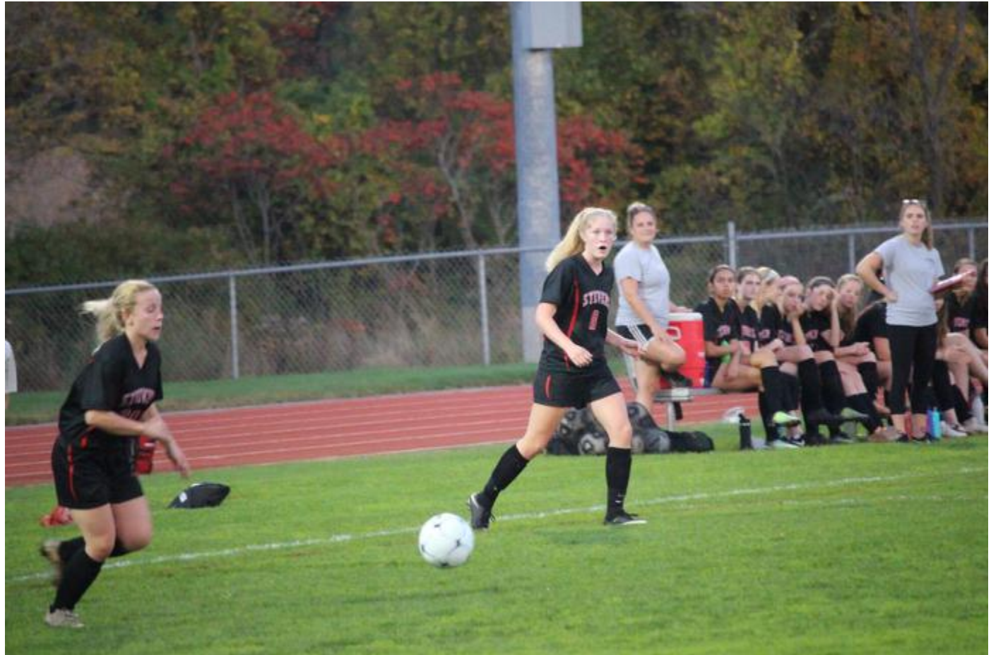
The SHS Girls Varsity Soccer won big Wednesday evening over the Huskies of Monadnock Regional High School.

Stevens got the ball first but for the second time in as many weeks fumbled on their open- (Continued on page B3)