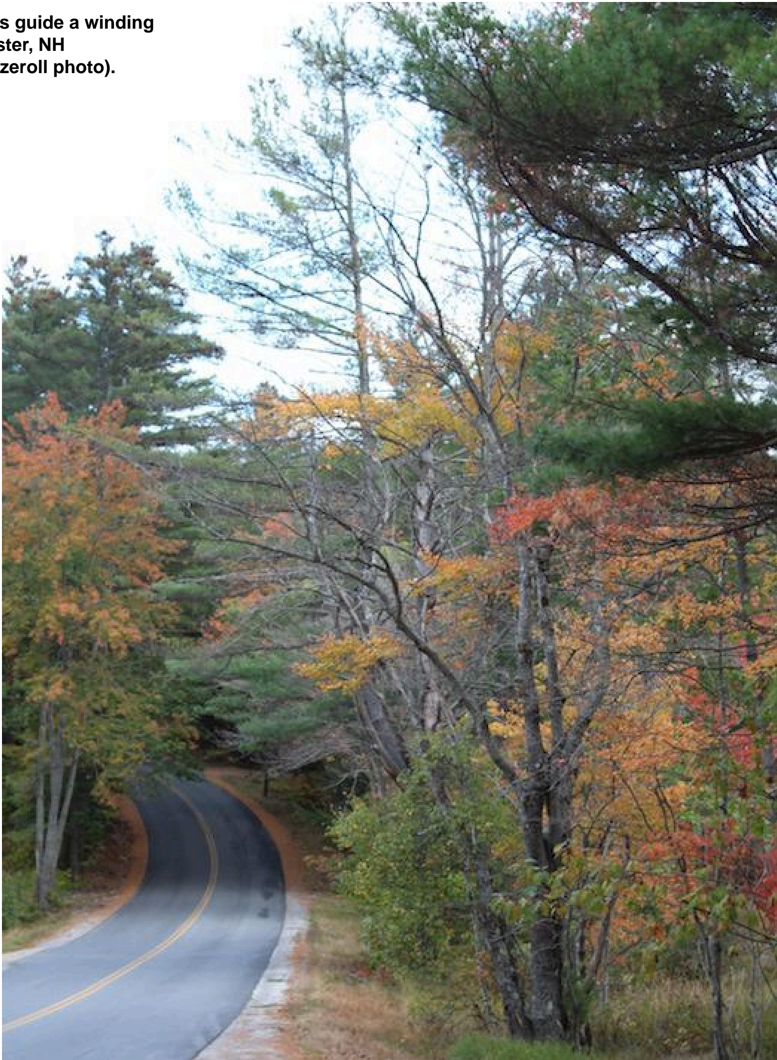
Autumn colors guide a winding road in Lempster, NH.