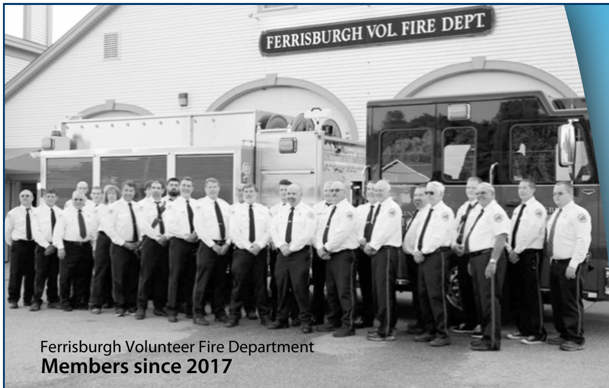
Ferrisburgh Volunteer Fire Department Members since 2017