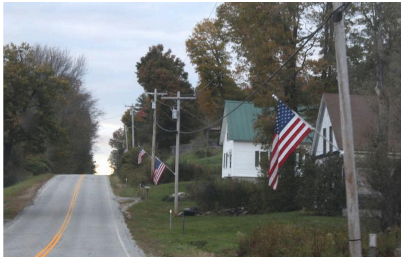
Flags in Lempster flying from numerous utility poles make for a lovely sight. They are in celebration of the 250th anniversary of the founding of Lempster.

CLAREMONT, NH--The Claremont Firefighter's Association 132nd Annual Fire Prevention Parade will take place on Friday, Oct. 13. It begins at 6:30 p.m., rain or shine. The parade starts at the Claremont Middle School, then travels on to South Street to Pleasant St. to Opera House Square and will disband in front of City Hall.