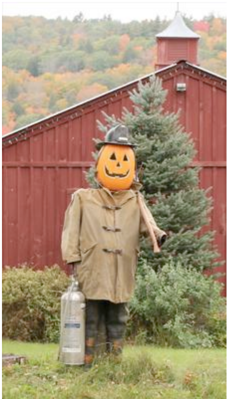
A small sampling of the great characters to see!