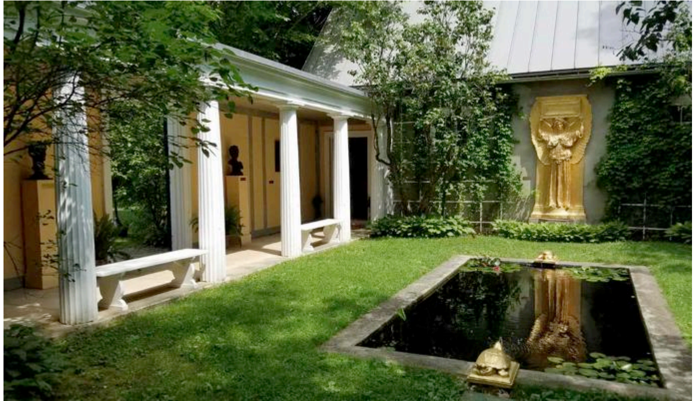
New legislation would redesignate the Saint-Gaudens National Historic Site as a National Historical Park.

"The designation of 'Saint-Gaudens National Historical Park' provides a better image to the public of what the park represents now, and to an even greater extent what the park and its partners are working to create here together for the future," Tolles continued. "We believe