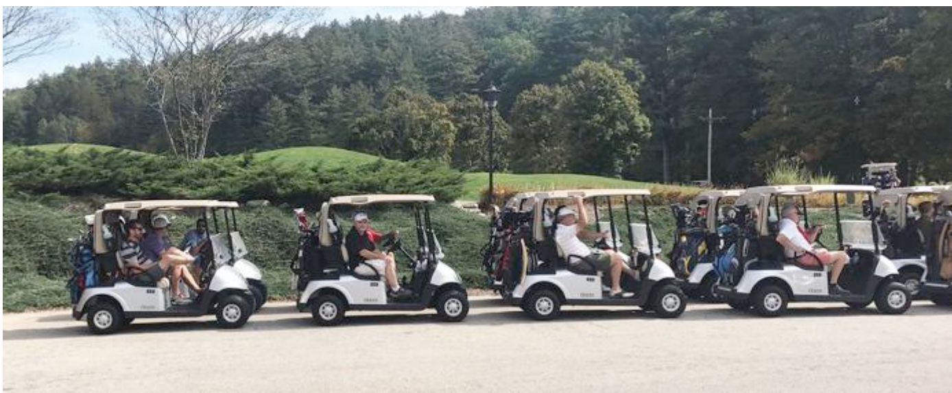
The 17th annual Springfield Hospital Challenge was held at Okemo Valley Golf Club on Thursday, September 21.