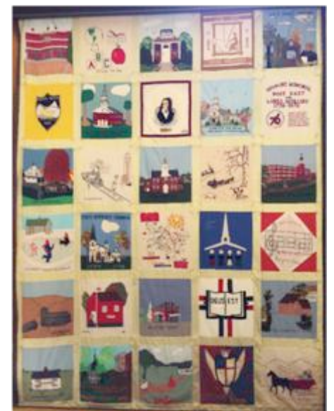
Photo: This 1976 quilt, the blocks of which were made by various organizations in Newport for the American Bicentennial celebration, will be on display in the Richards Free Library ballroom during the program, its first viewing in close to 50 years.

This program is free, open to the public, and the ballroom is handicapped accessible. Light refreshments will be served in the Ballroom.