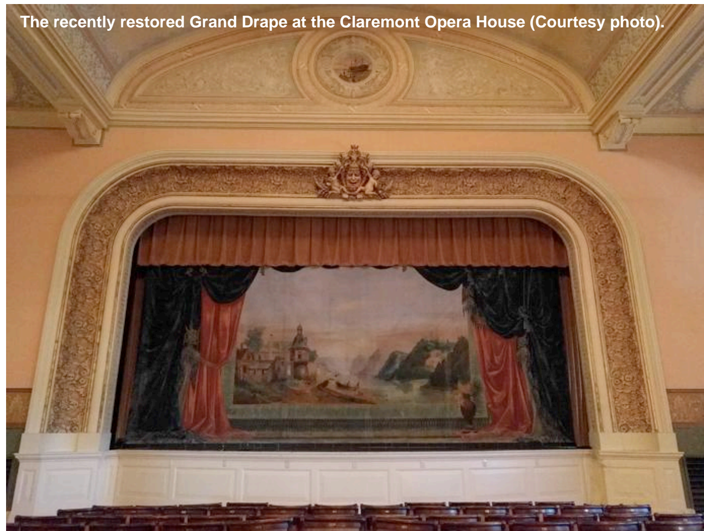
The recently restored Grand Drape at the Claremont Opera House.

Participants in the ServSafe training will learn basic food sanitation principles, from receiving to serving, improving the quality of food served, lowering costs, increasing profitability,