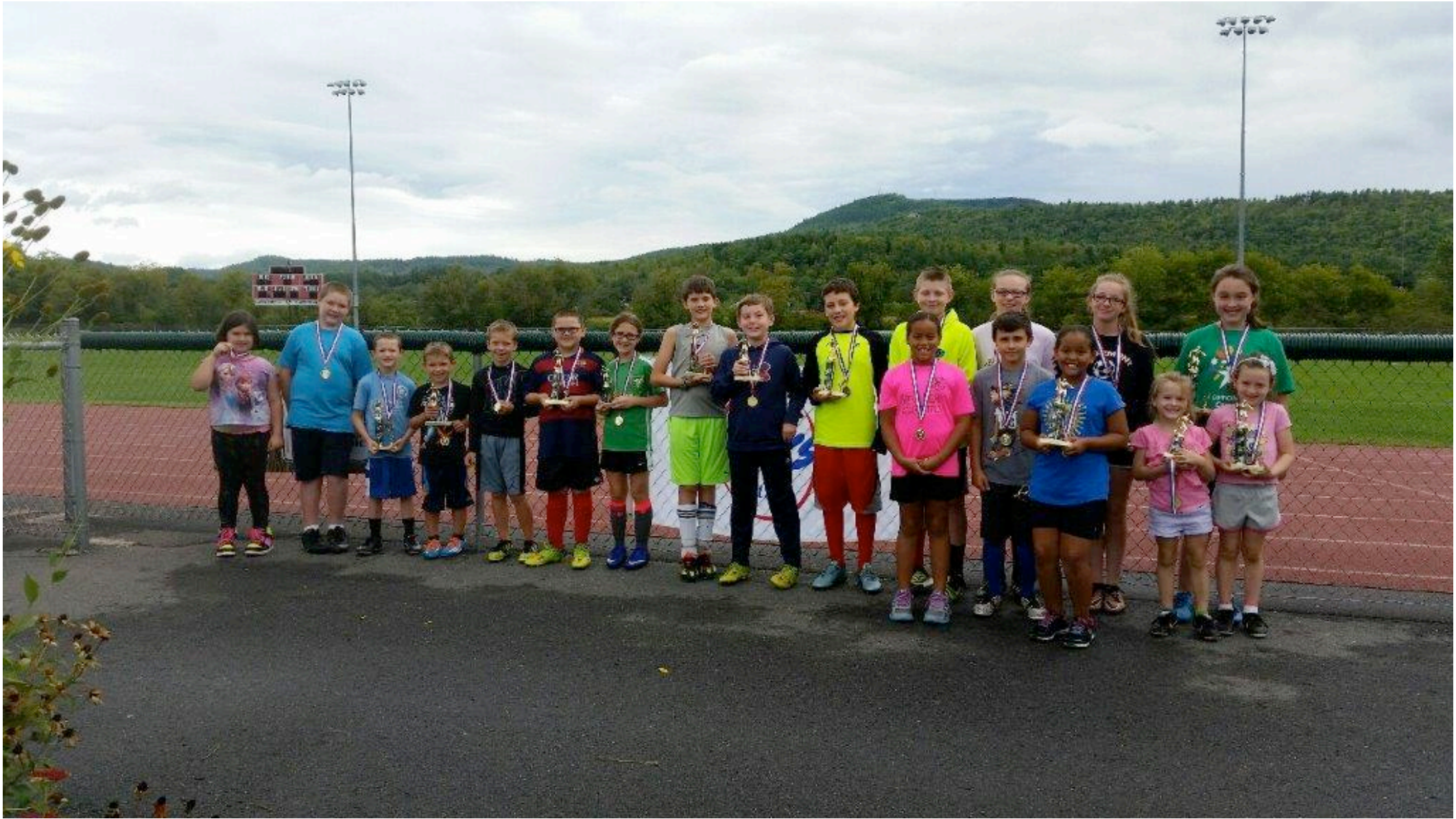
The Claremont Elks Lodge #879 recently held its Annual Soccer Shoot for boys and girls in Claremont.