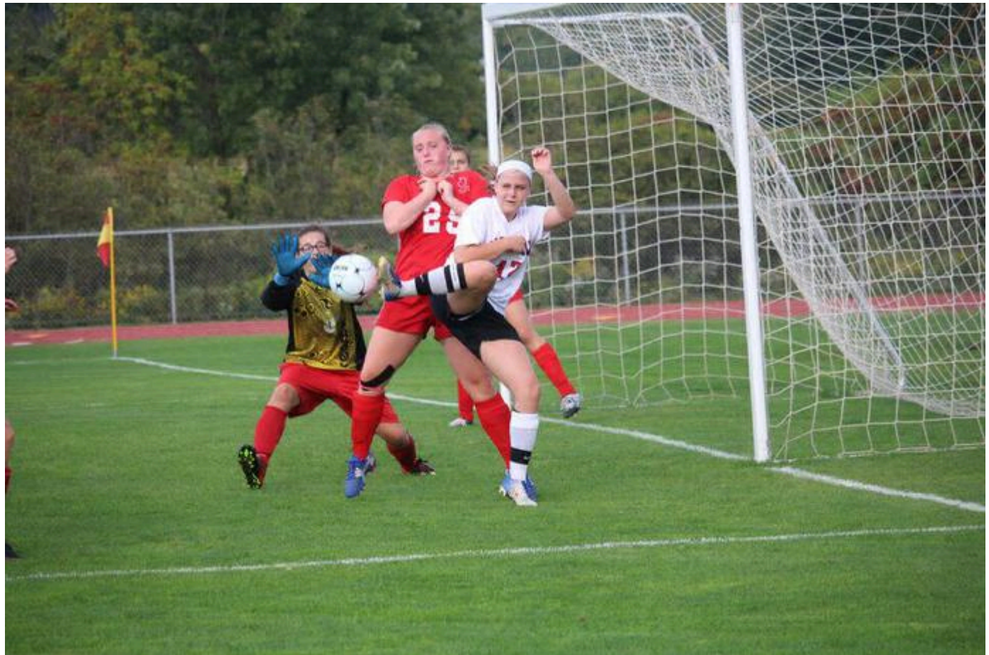
There was plenty of action at the net as the SHS Girls Soccer team scored back to back wins over Laconia High School Friday afternoon/evening. The varsity won 5-1, while the JV's edged out a win 3-2.