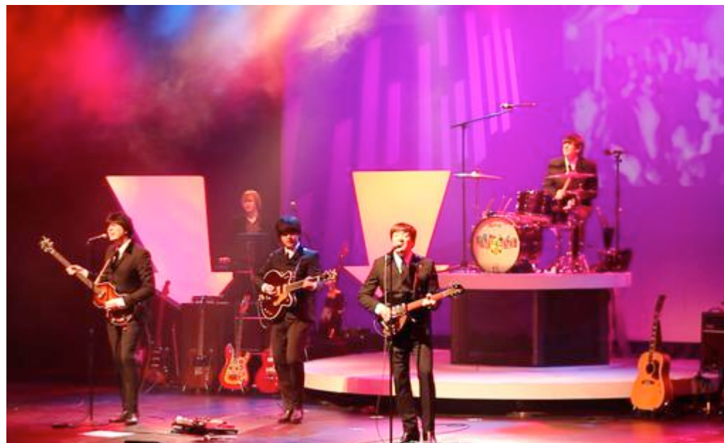
Beatlemania Now will be appearing at the Claremont Opera House on Sept. 23.

Beatlemania Now is a must experience for all ages, Friday, Sept. 23, 8:00 p.m. Tickets can be purchased in person at the Opera House box office, by phone at 603-542-4433, the night of the show, or online at claremontoperahouse.com . Ticket prices range from $25 to $35, plus facility and handling fees. Five dollar discounts available for seniors, students, and members of the armed forces. One free child age 10 or younger free with parent.