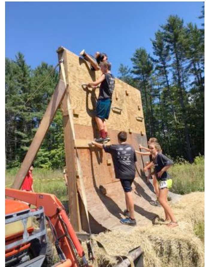
Left: Racers were all smiles at the start of the competition; above: The climbing wall.

remont Parks and Recreation Department, who helped organize the event. "We make a lot of people very happy. It's challenging, but really it's all about the fun. It's a fun day."