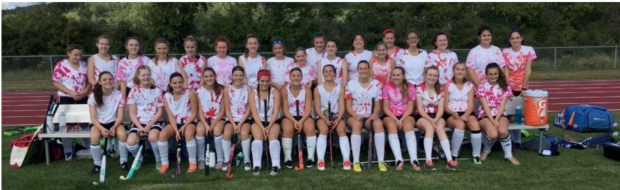
Group photo of this year's Stevens Field Hockey team; the team kicks off its season Wednesday as it faces Kearsarge at home; the action begins at 7:00 p.m.