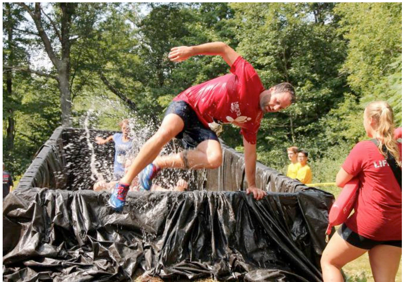
The Claremont Parks and Recreation Department held its annual Reach the Peak adventure challenge at the Arrowhead Recreation Area on Saturday, Aug. 26. More photos, results, in Section B.