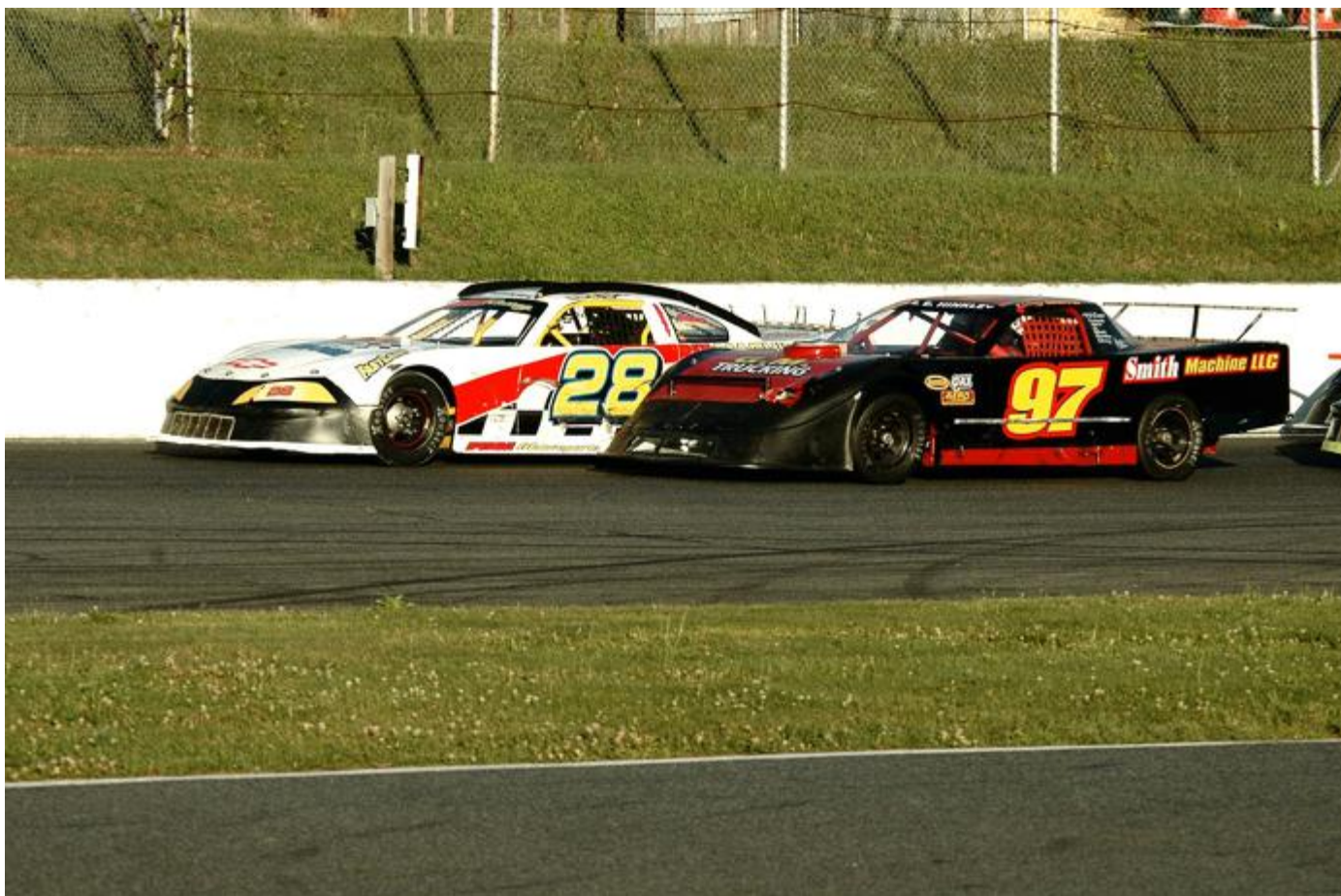
Ricky Bly (28) gets by Craig Smith (97) in Super Streets heat race action.