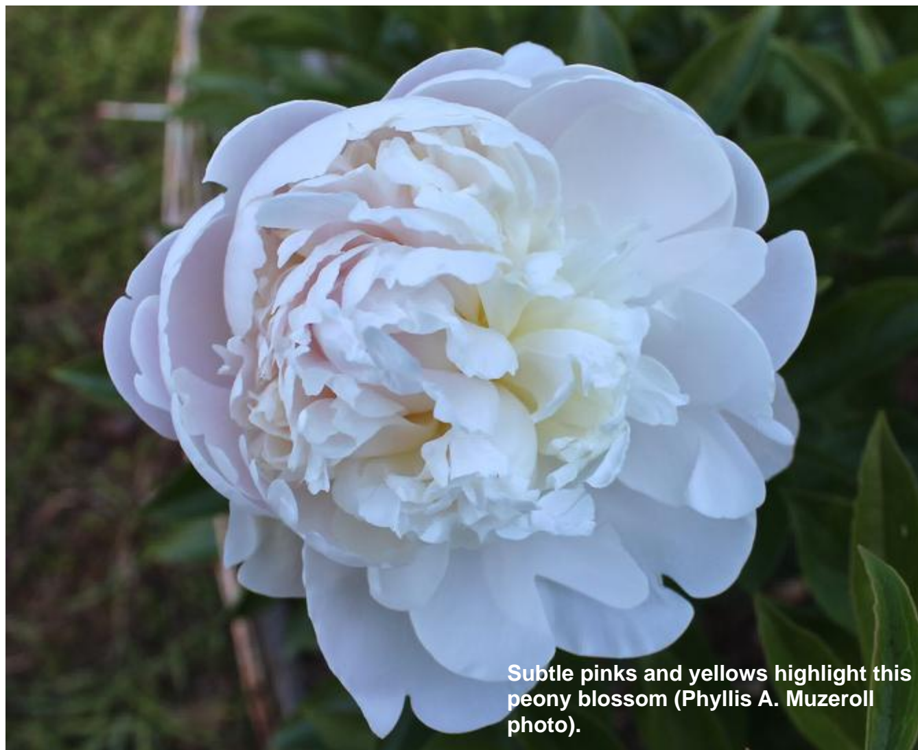
Subtle pinks and yellows highlight this peony blossom (Phyllis A. Muzeroll photo).

If you'd like to be a volunteer, go https://www.signupgenius.com/go/30e0f4ea5af2ba5f-b6-brownsville .