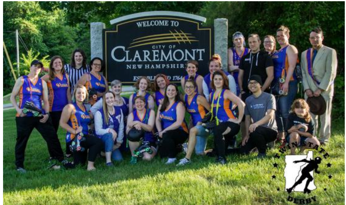
Twin State Derby.