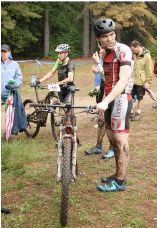
Heading into "Gravity Cavity"; bikers were covered in mud by the end of the race.