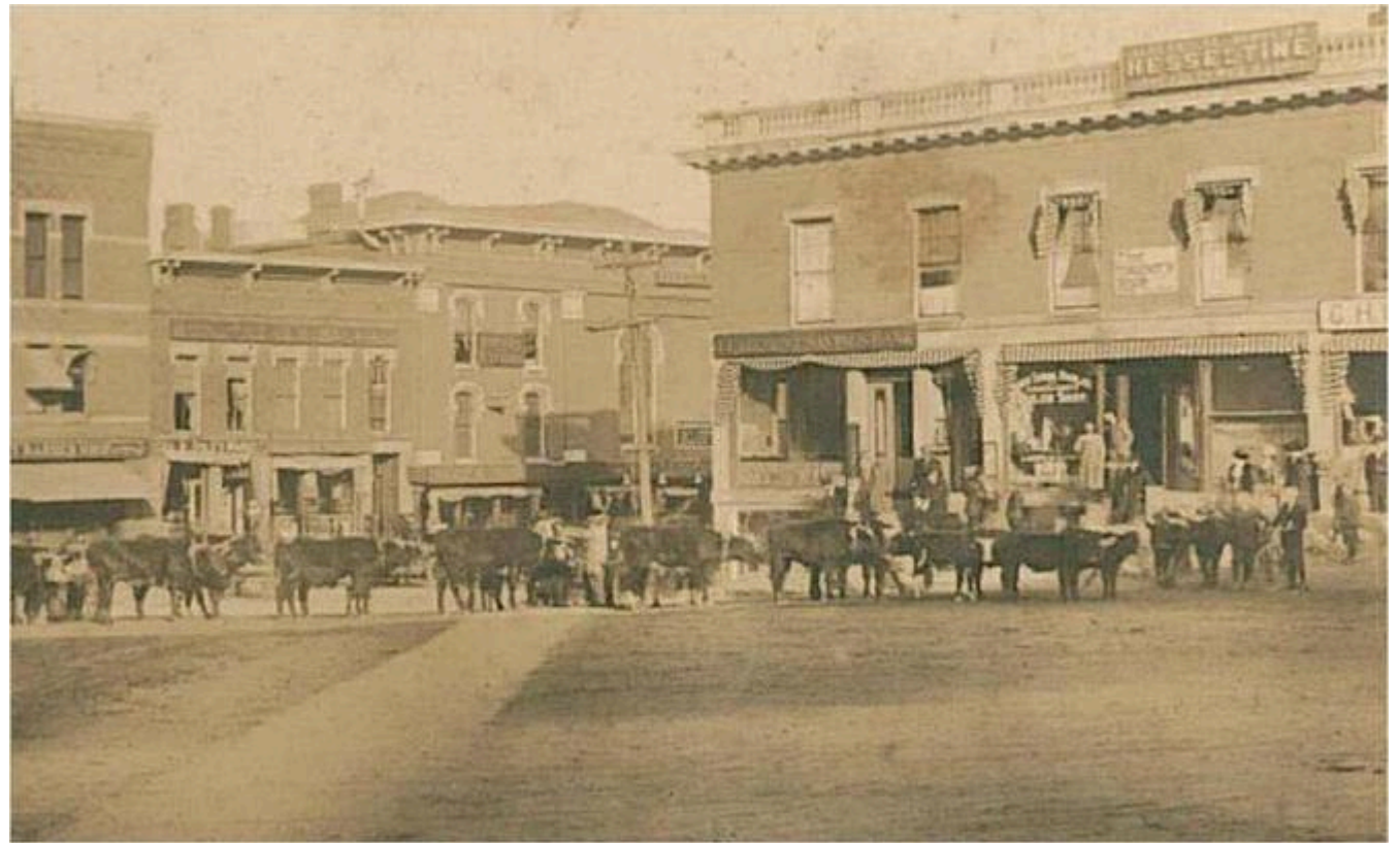
Top: Tremont Square in Claremont really did have bulls in it at one time; hence, the name "bullpen" that has been in the local news so much lately. Below: Claremont National Bank (Photos, courtesy of Merle Boardman).