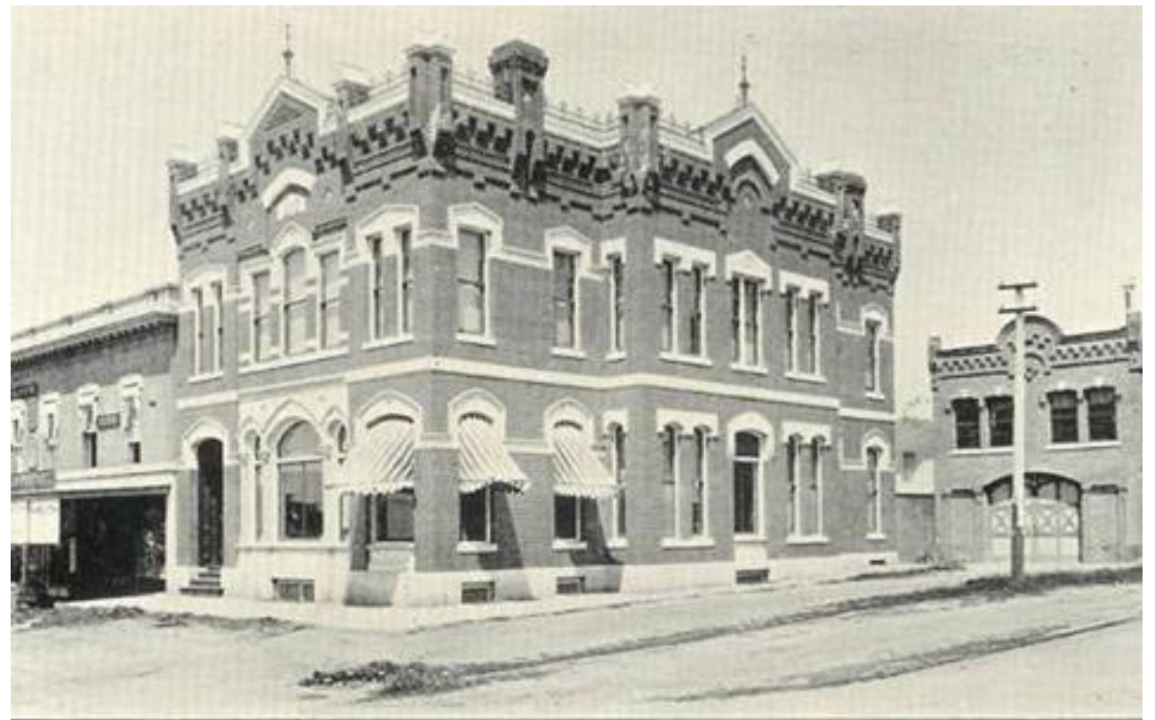
CLAREMONT NATIONAL BANK.