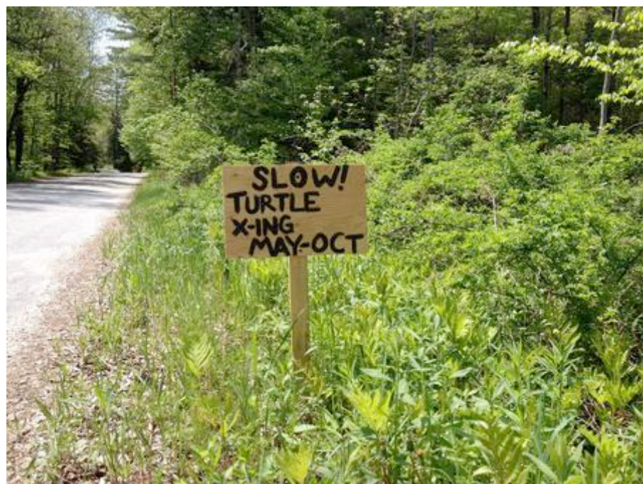
Drivers on the Lempster portion of Crescent Lake Road are being greeted by a sign warning of a turtle crossing. Slow going for drivers and four-footed "pedestrians"? (Phyllis A. Muzeroll photo).

CLAREMONT, NH--The Claremont Farmers' and Artisans' Market will be held every Thursday through October 6th, from 4:00-7:00 p.m. (rain or shine); they only call the market for lighting. A strong selection of vendors with more added weekly and a great music schedule.