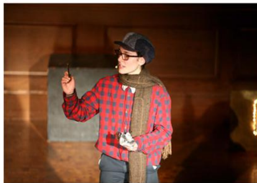
Photos from the Stevens High School presentation of "Willy Wonka Jr." last Thursday through Sunday.