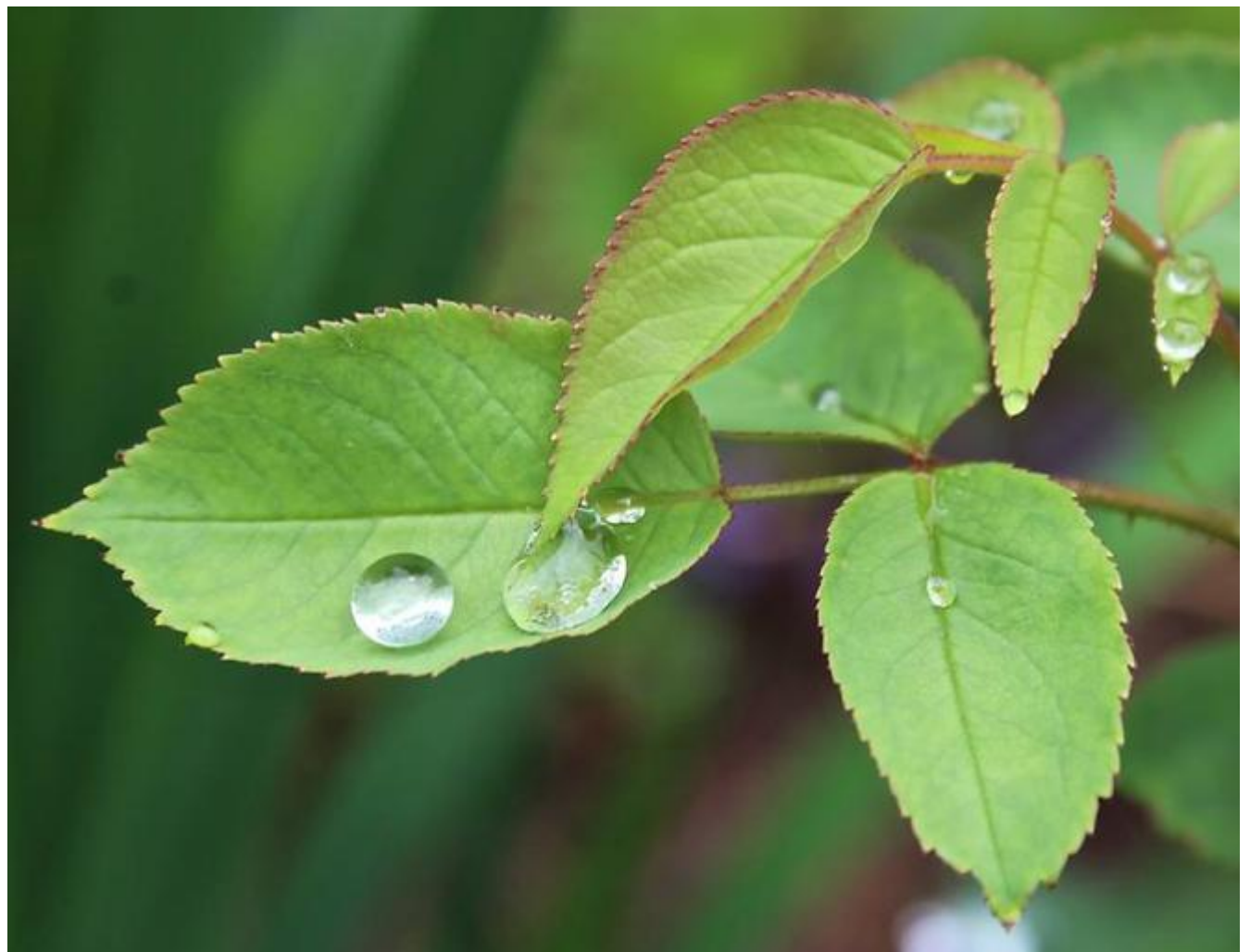
The quiet elegance of raindrops is reflected following a recent shower.

8:12 PM: Engine 3 responded to Pleasant St. for a medical call.