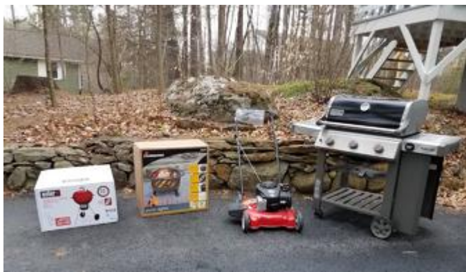
Prizes donated by Osgood Construction LLC for Newport Rotary Club's 8th annual penny sale.