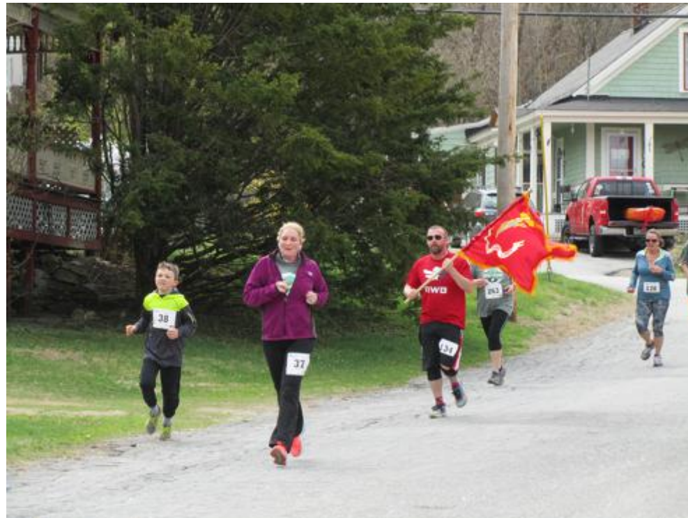
The Rock Your Camo 5K and Dirty Dash, sponsored by Red River, was held on Saturday in Claremont. The event, part of the Red River Charitable Foundation, benefits local veterans. Runners passing the e-Ticker News home base included US Senator Kelly Ayotte, right, and a runner who brought the Marine Corps flag with him. Story and more photos in Section B.