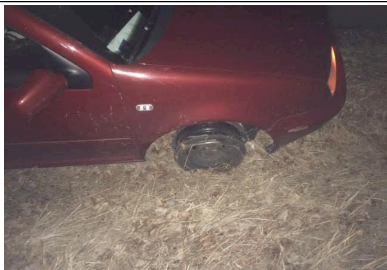
This car was seen driving on three tires in Cornish early Sunday morning.