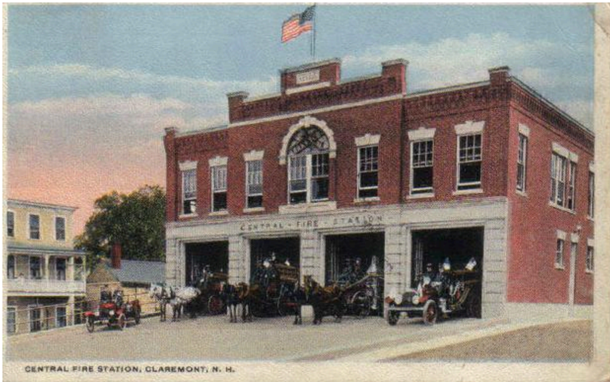
The Central Fire Station in Claremont continues to serve us well.