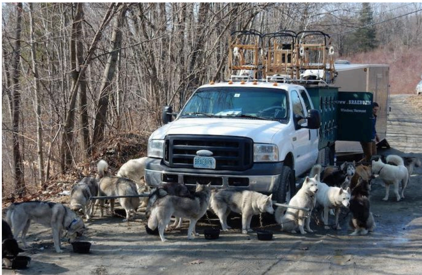
These Siberian Huskies, headquartered in Windsor, VT, give sled tours; they are frequently seen alongside the road between Claremont and Newport.