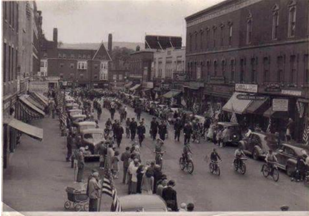
Pleasant Street in Claremont, in the 1940s.