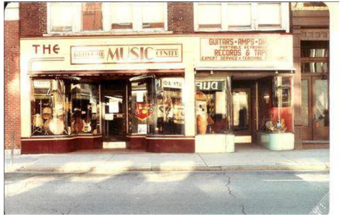
The Whitcomb Music Center in Claremont. Was it one of your favorite shops?