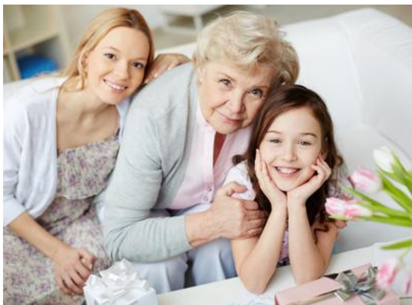
Panel discussion of women's health topics

Join our medical staff for a panel discussion over a glass of wine.