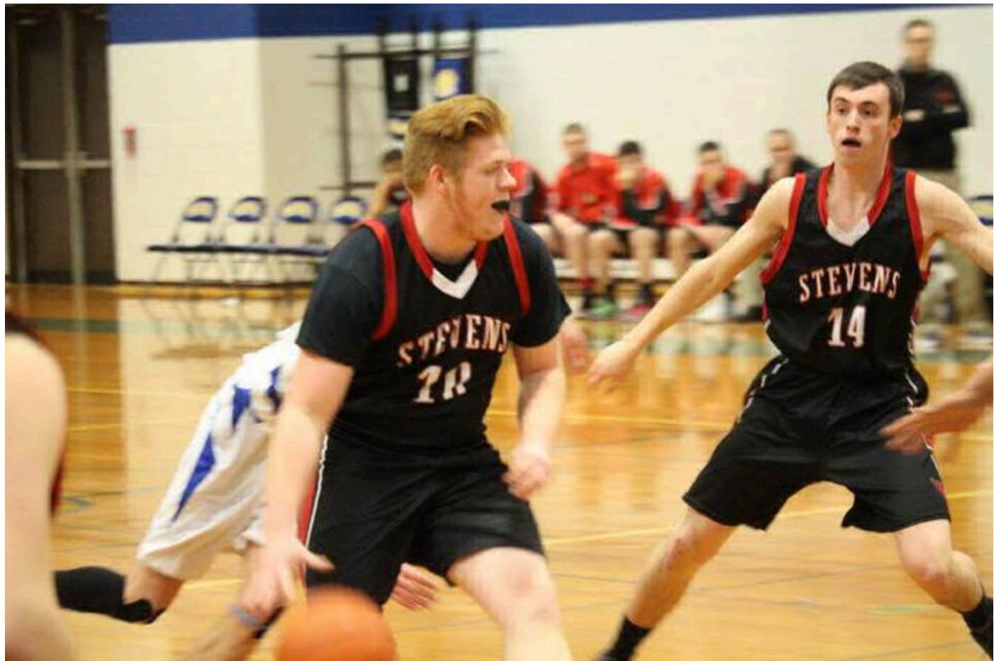
The SHS Cardinals hung close for a good chunk of the game before Gilford High School pulled ahead for the win last week in the opening round of the NHIAA D3 playoffs.

Stevens concluded the season with a 10-9 record.