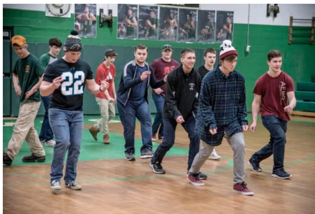
The 2018 Apple Blossom contestants at rehearsal (Courtesy photos).