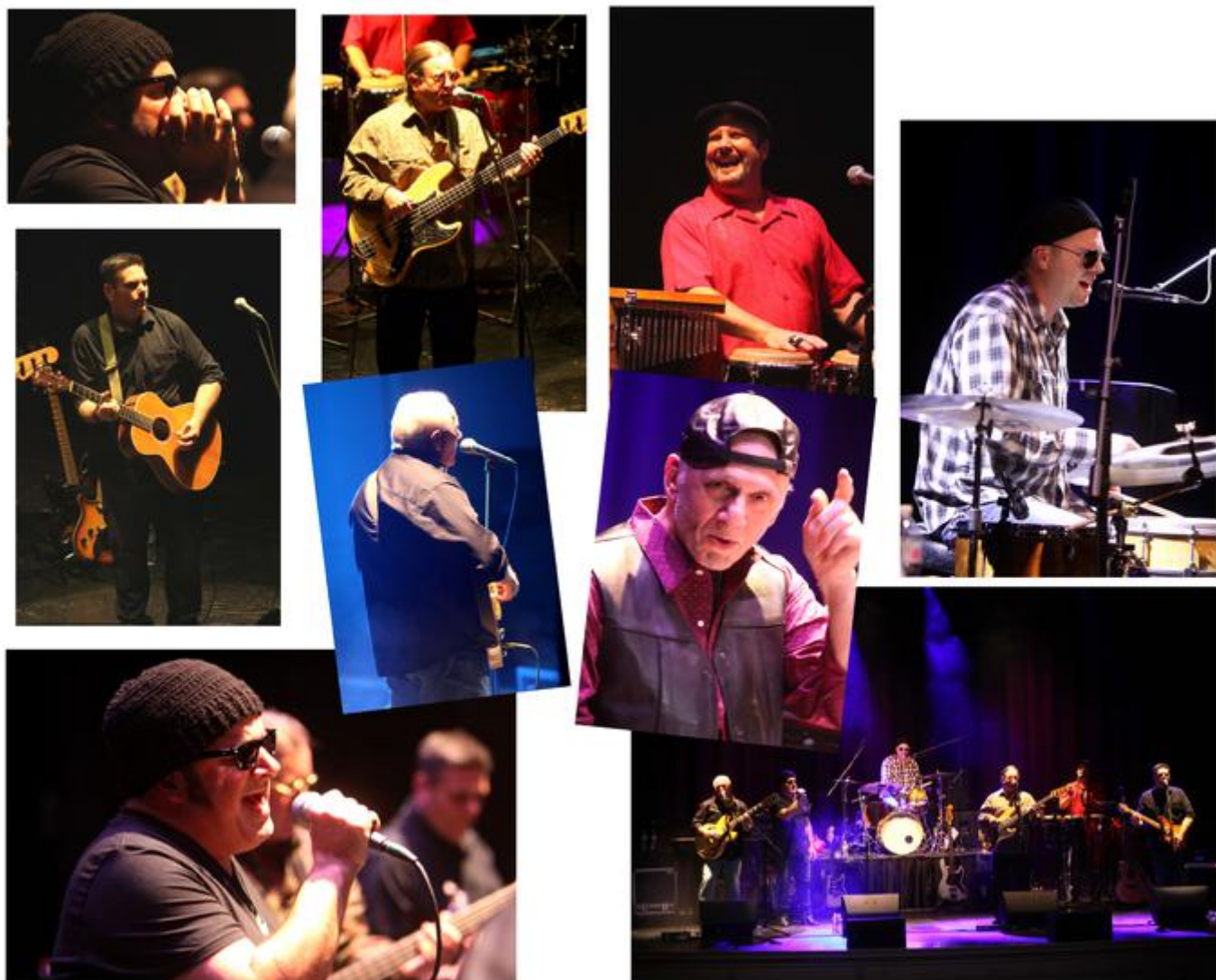
Collages by Stacy Bathrick