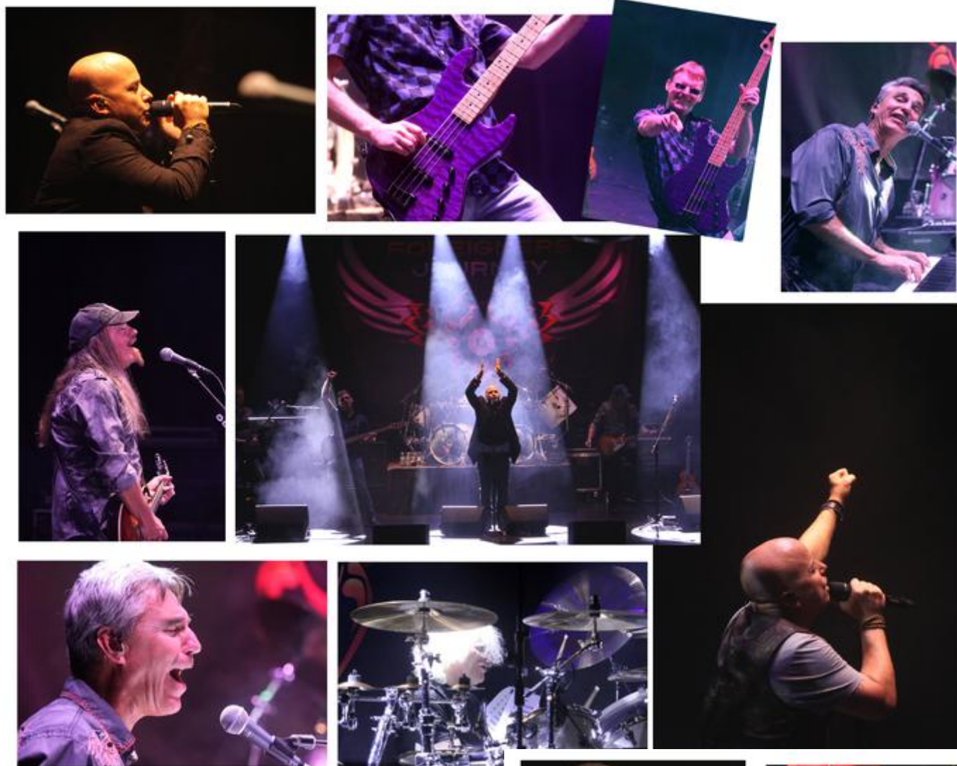
The last two shows at the Claremont Opera House featured the tribute shows, Foreigner's Journey (top) and Takin' It To The Street—Doobie Bros. Tribute.