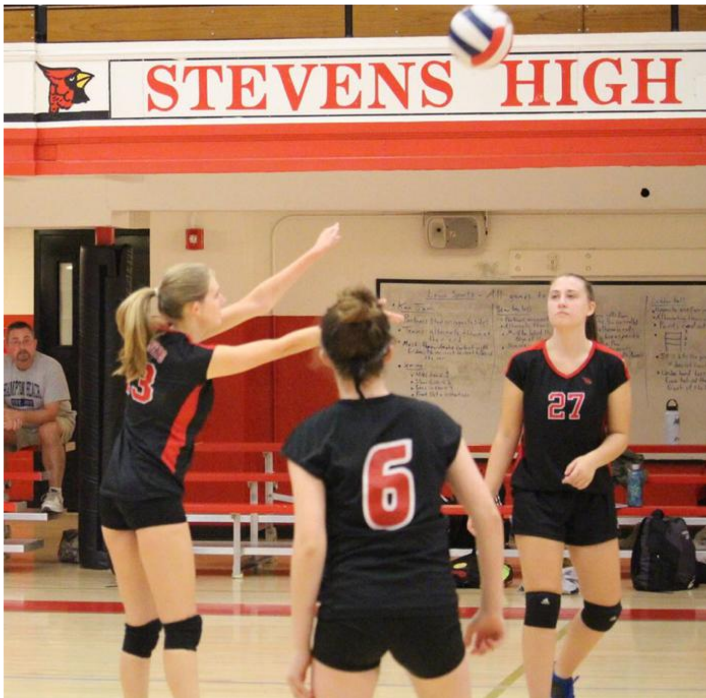
The SHS JV and Varsity Volleyball teams hosted Belmont Wednesday afternoon. A reminder that the Senior game for the volleyball team will be this Monday.

The Lebanon Raiders came to town this past Friday and displayed the speed and ath-