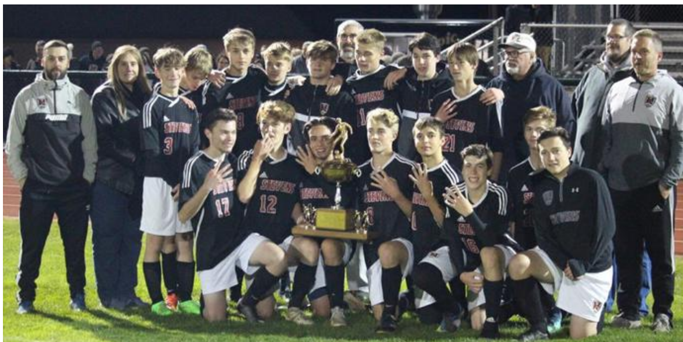
The Bernard Cup stays in Claremont for another year as the SHS Boys Soccer teams swept the Wildcats from Fall Mt.: JV 9-3 and varsity 5-0, Tuesday night.