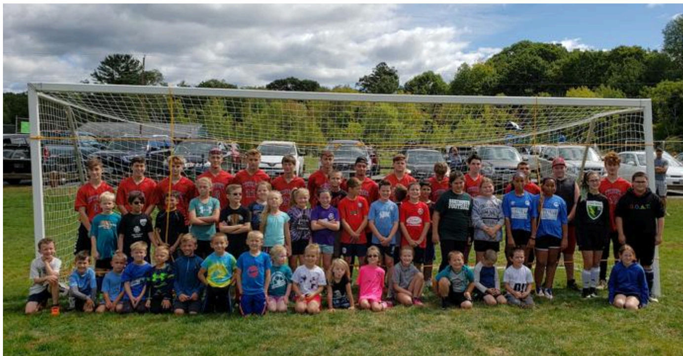
Group picture of all the kids who participated in the Elks Soccer Shoot.

The recent Elks Soccer Shoot had a total of 39 kids who participated in the event. Sixteen