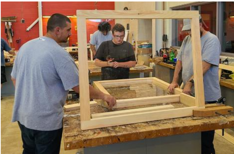
The team inserts a sheet of plexiglass between the two halves of a frame. The frame is then drilled together, but it can easily be dismantled so that all the pieces can be reused (Eric Zengota photo).

The TRAILS participants will construct three cubicles based on this prototype, which was built by the district's maintenance staff. Special education students can choose this as a quiet workspace. The cubicles can also be used for "de-escalation," when a student needs to be separated from others in order to calm down (Eric Zengota photo).