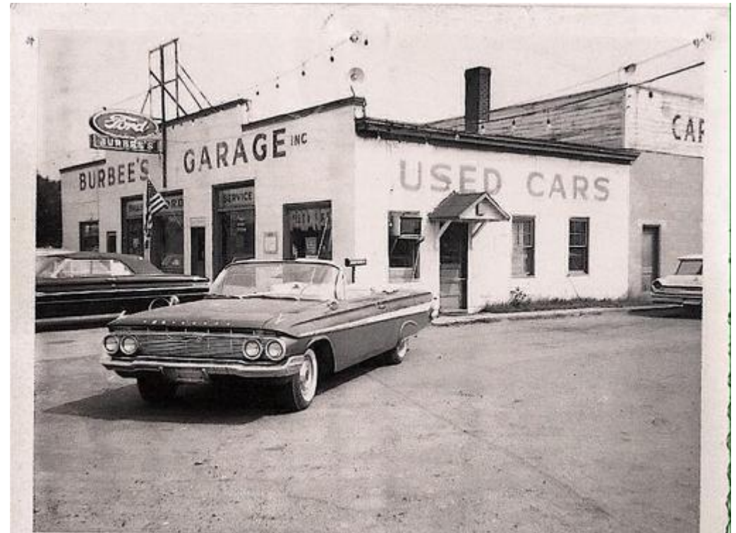
The Colonial Hotel in Claremont, Burgee's Garage on Washington Street, Broad Street Park.