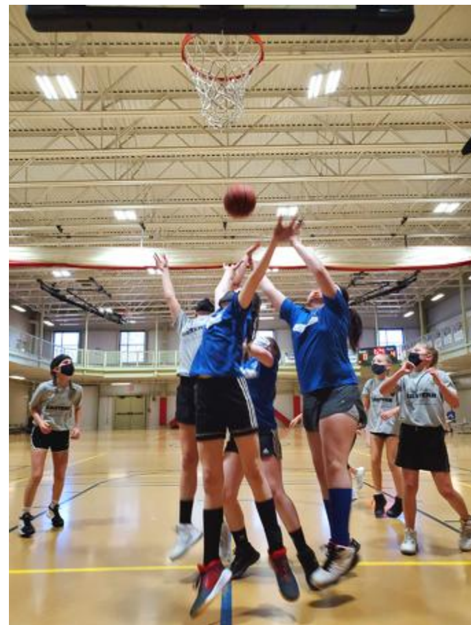
Practically Perfect Pyramid — Nets vs. Celtics (5/6 Boys); Balletic Battle — Sparks vs. Storm (5/6 Girls); Coaching Up a Storm.