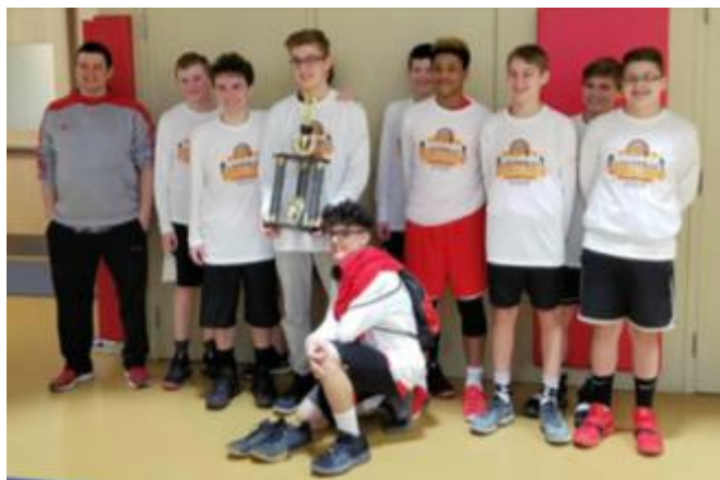
Above: Claremont Middle School A Team Below: Claremont Middle School Eagles