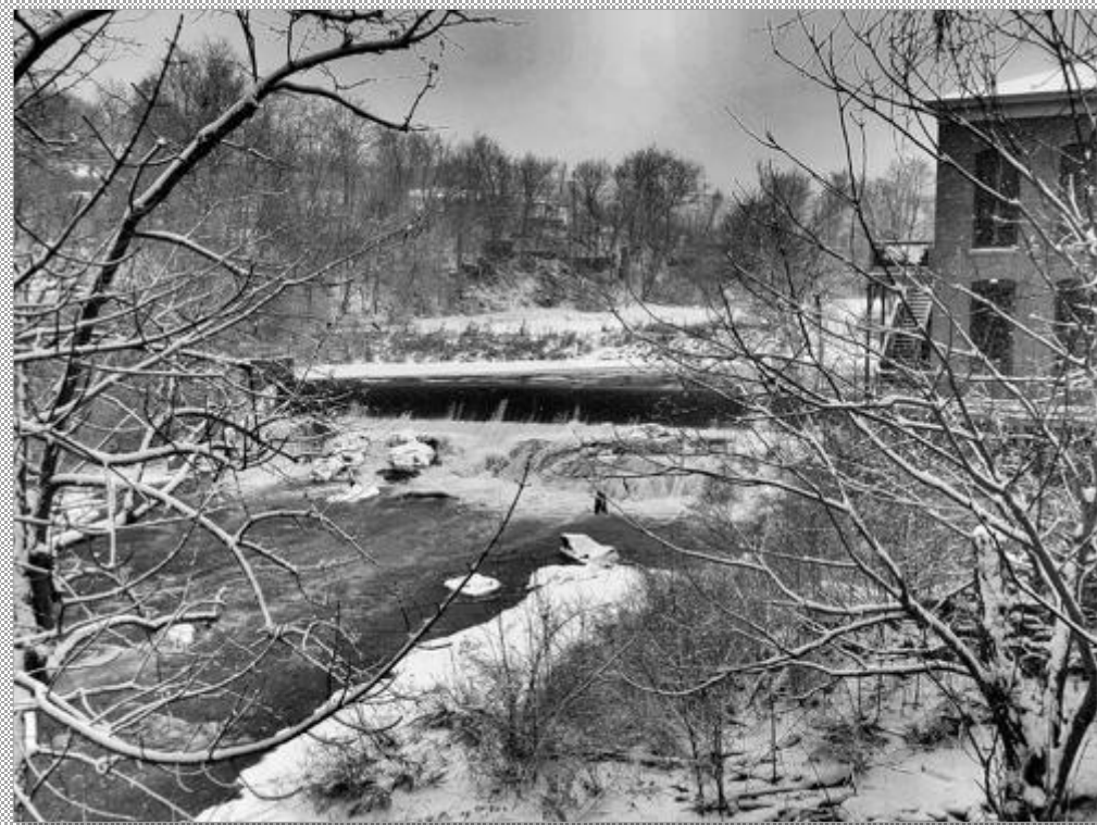
Claremont ~ 7 January 2022 ~ Eric Zengota